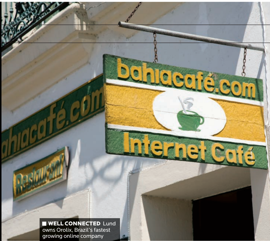
■ WELL CONNECTED Lund owns Orolix, Brazil's fastest growing online company